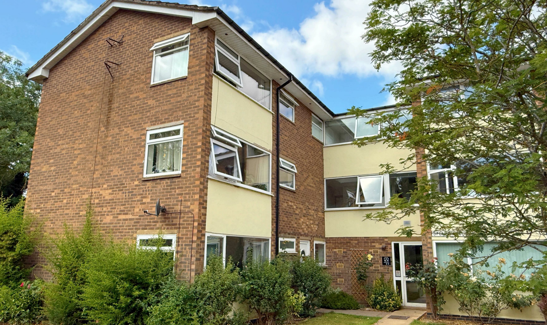
Cherry Orchard , Stratford-upon-Avon, CV37 9AL